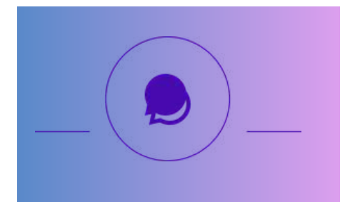
Sustainability Join a sustainabilityfocused platform to drive positive change and business growth.