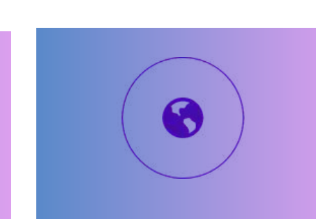
WORK-LIFE BALANCE Exceptional networking with influential businesswomen from all arund the globe